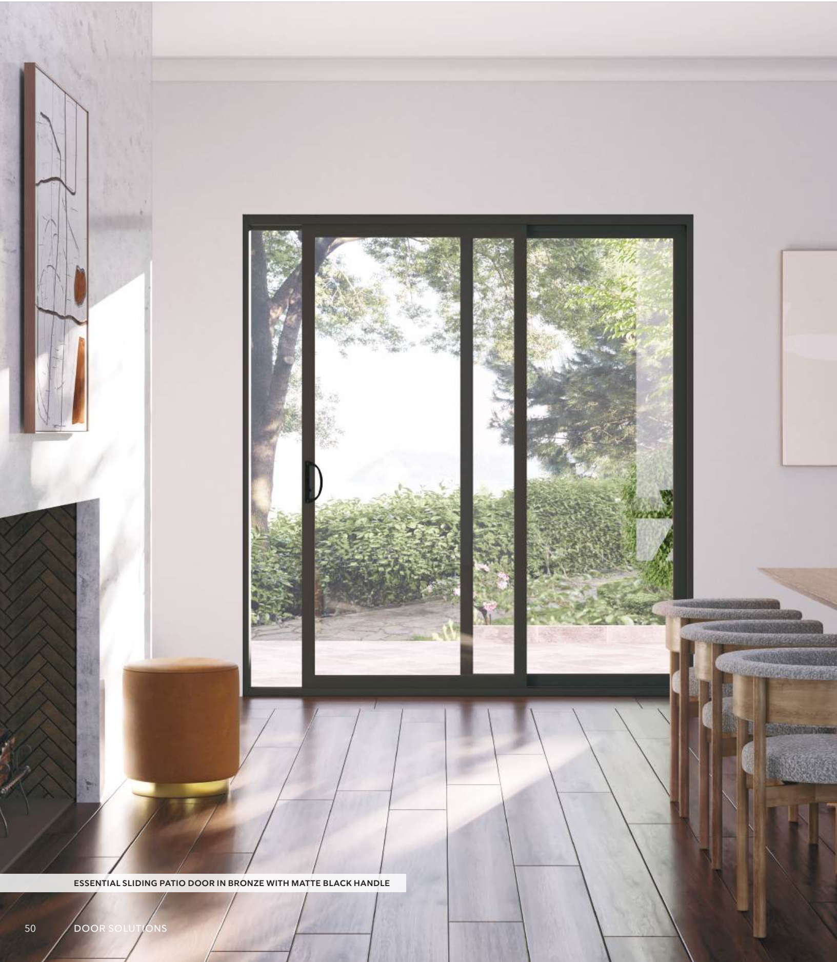
ESSENTIAL SLIDING PATIO DOOR IN BRONZE WITH MATTE BLACK HANDLE