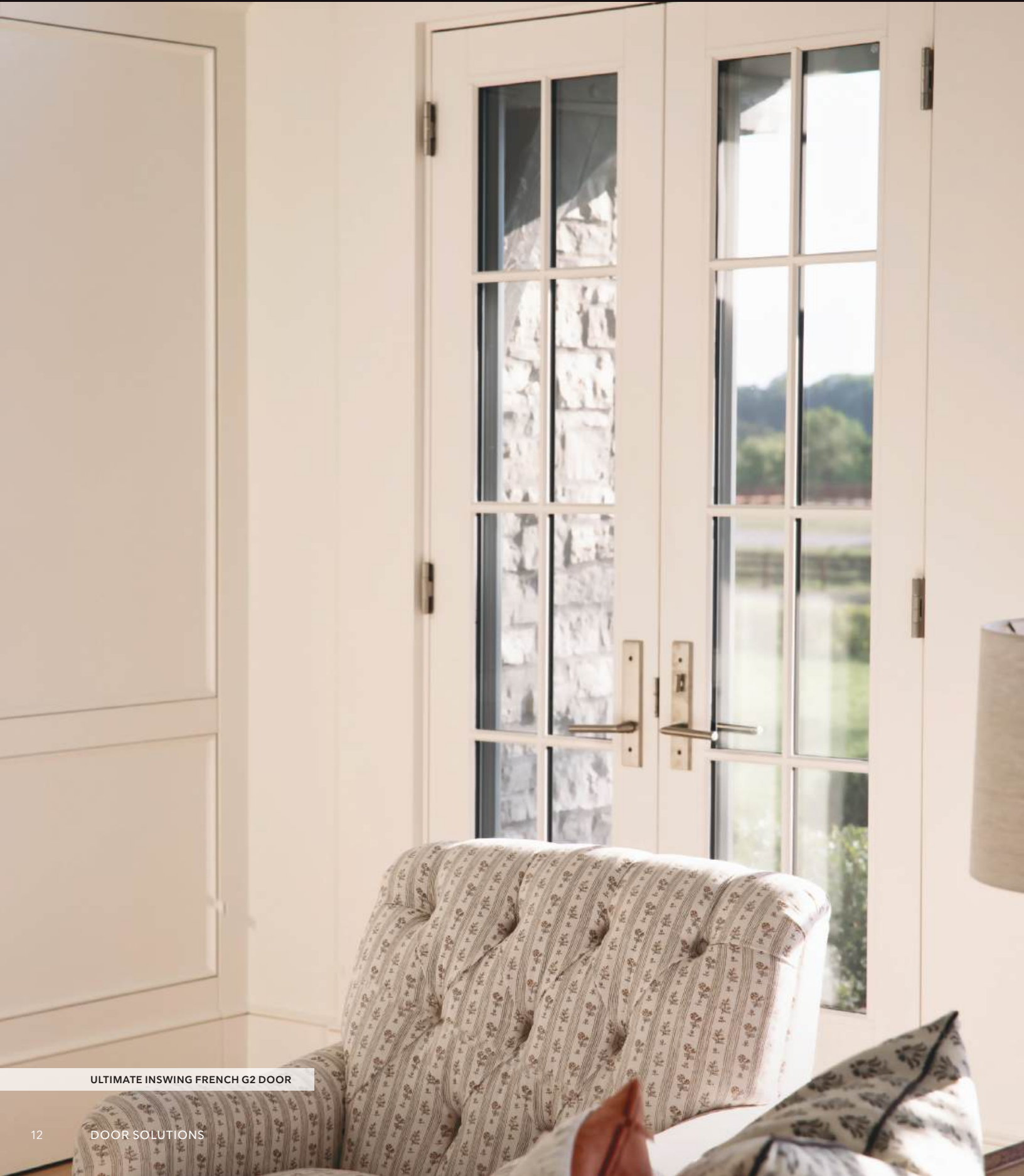
ULTIMATE INSWING FRENCH G2 DOOR