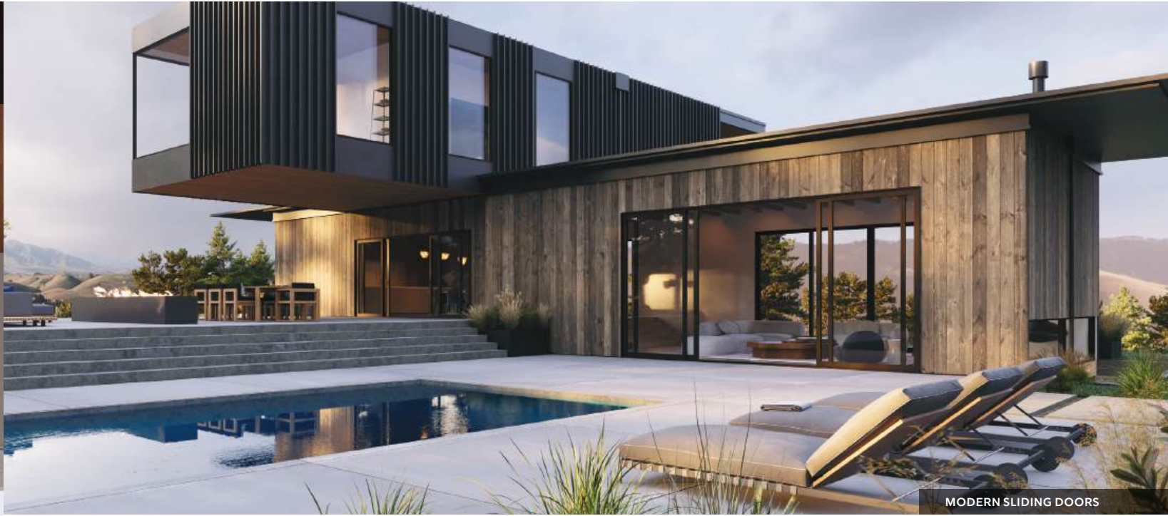
MODERN SLIDING DOORS