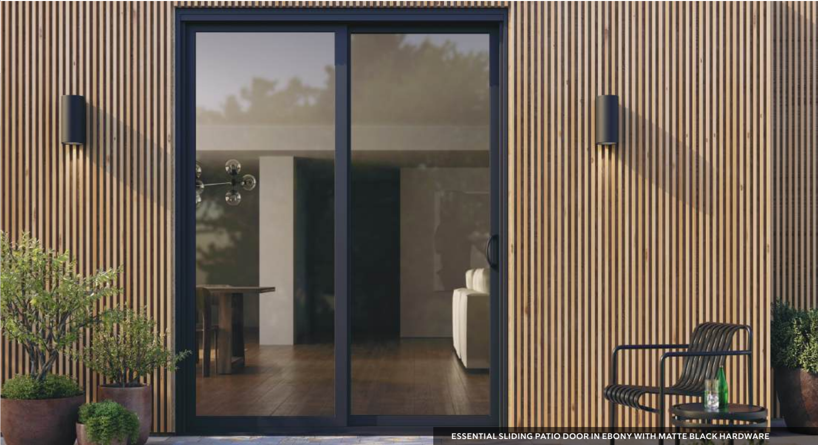
ESSENTIAL SLIDING PATIO DOOR IN EBONY WITH MATTE BLACK HARDWARE