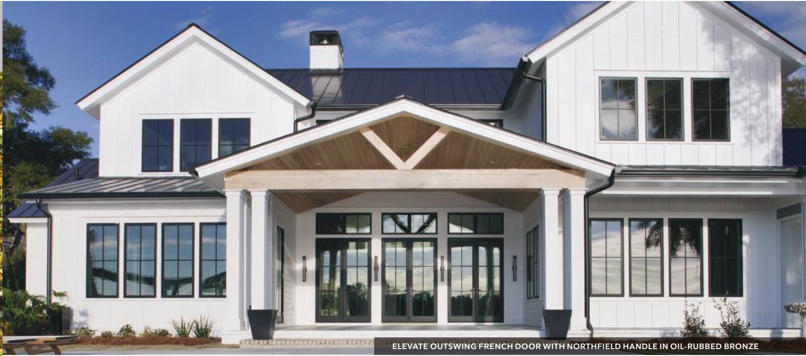
ELEVATE OUTSWING FRENCH DOOR WITH NORTHFIELD HANDLE IN OIL-RUBBED BRONZE

The Marvin Elevate Outswing French door is ideal when interior square footage is limited, opening your home to an outdoor space without interrupting interior flow or design. Options are available with 1-, 2-, and 3-panel configurations up to 8 feet high with warm, stainable wood interiors and a virtually maintenance-free Ultrex® fiberglass exterior that stands up to the elements.