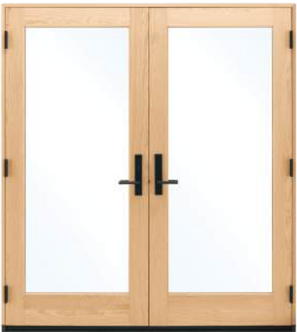
INTERIOR VIEW OF INSWING

The Ultimate Swinging French door G2, available as both inswing and outswing, delivers a traditional aesthetic with 4 ¾ inch top rail and either a 8 ⅛ inch or 4 ¾ inch bottom rail. Select sizes up to 10 feet high and 14 feet wide to maximize views and access to the outdoors. Choose up to 4 panels with an ogee or square interior glazing profile.