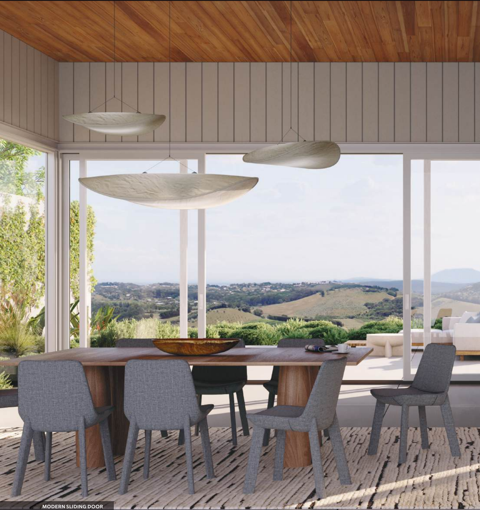
MODERN SLIDING DOOR