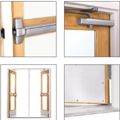
PANIC RIM, CLOSER, REMOVABLE MULLION, AND SILL OPTIONS