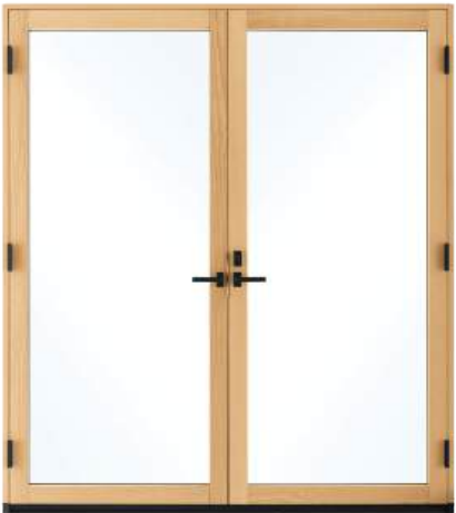
INTERIOR VIEW OF INSWING

The Ultimate Swinging Narrow Profile door, available as both inswing and outswing, is expertly crafted to provide industry-leading performance with narrow sightlines. Select sizes up to 10 feet high and 14 feet wide with robust 2 ¼ inch standard panel thickness. Dual panel doors available in equal or unequal panel widths. This door comes with square interior and exterior glazing profiles for a contemporary look and has an optional ogee glazing profile for a more traditional aesthetic.