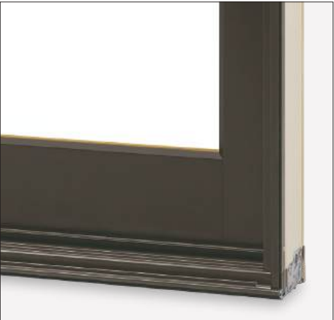
SILL DETAIL SHOWN IN BRONZE