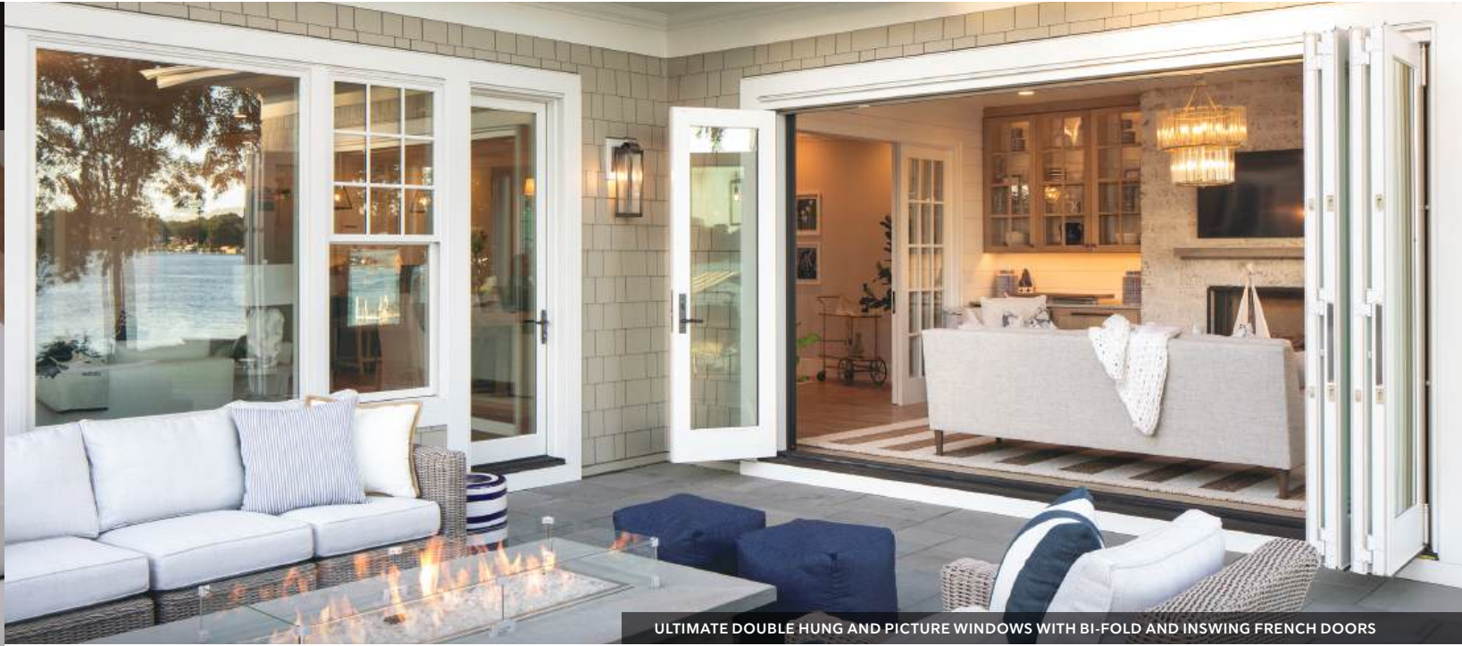
ULTIMATE DOUBLE HUNG AND PICTURE WINDOWS WITH BI-FOLD AND INSWING FRENCH DOORS