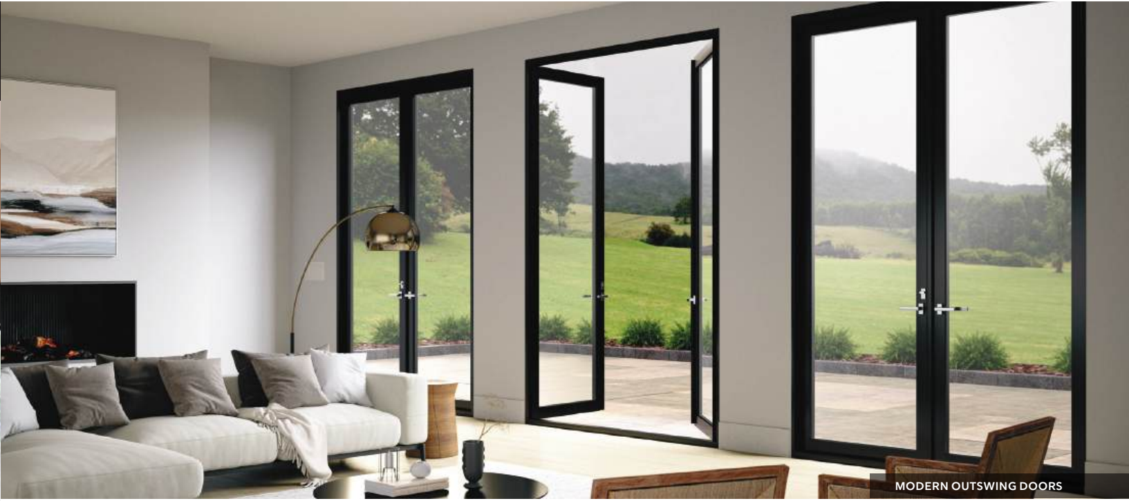
MODERN OUTSWING DOORS