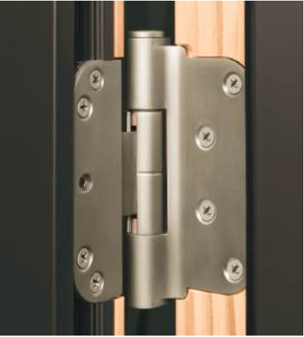
DOOR HINGE SHOWN IN SATIN NICKEL