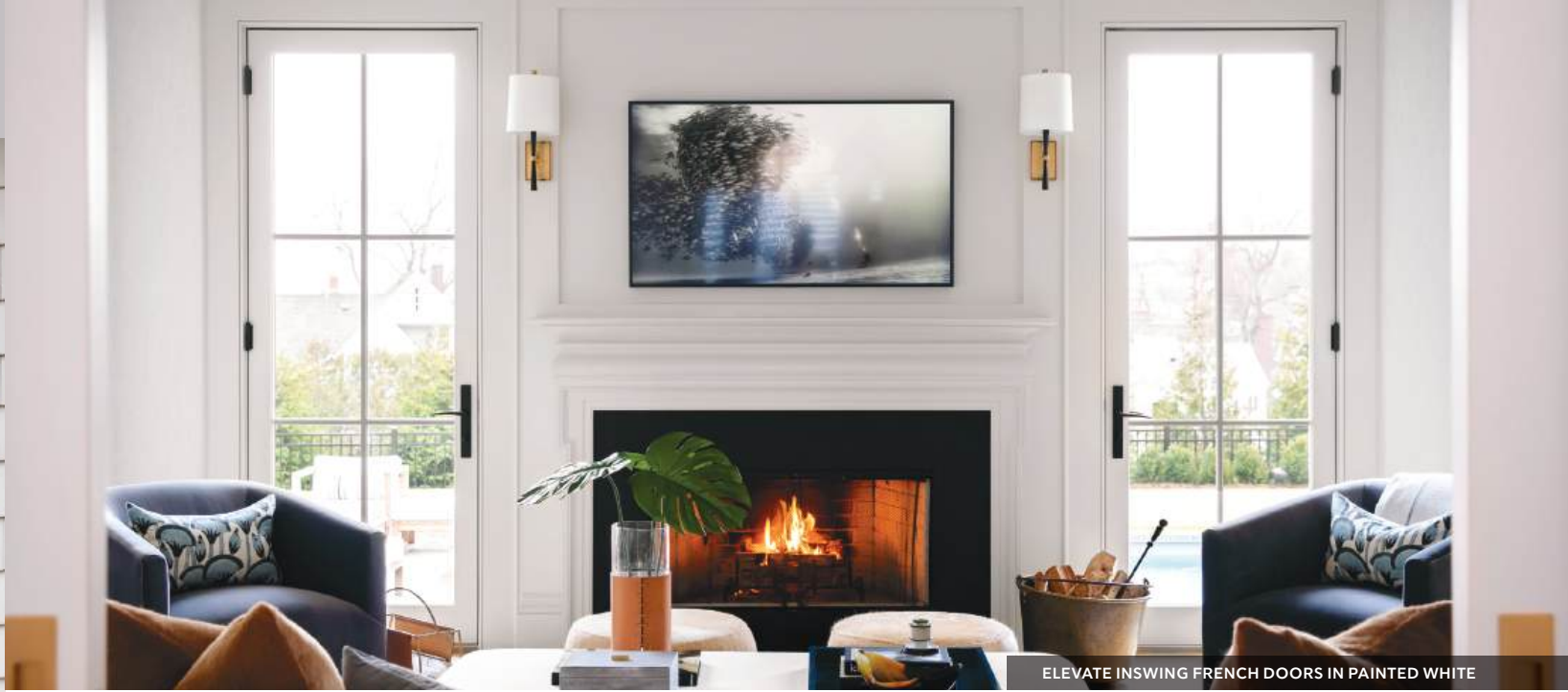
ELEVATE INSWING FRENCH DOORS IN PAINTED WHITE