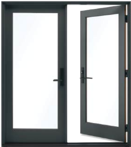
EXTERIOR VIEW OF INSWING