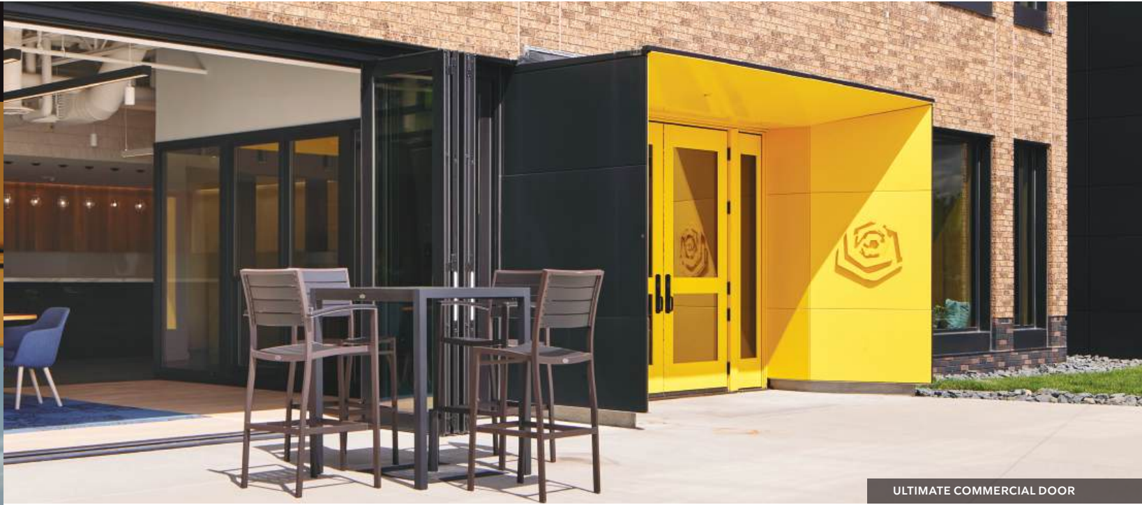
ULTIMATE COMMERCIAL DOOR