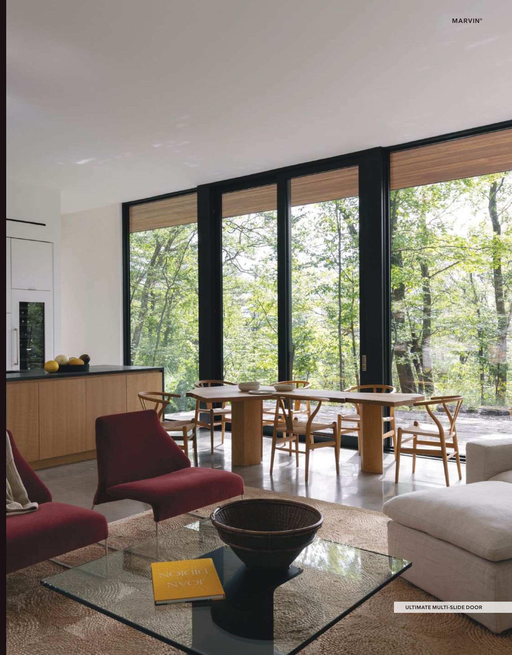
ULTIMATE MULTI-SLIDE DOOR

Our Ultimate product line unites beautiful design with exceptional handcrafted quality. Add character to almost any space with our most extensive selection of shapes, styles, sizes, and options—including wood interiors protected by tough aluminum clad exteriors. With nearly endless possibilities for customization, Ultimate can match your vision and give it room to grow.