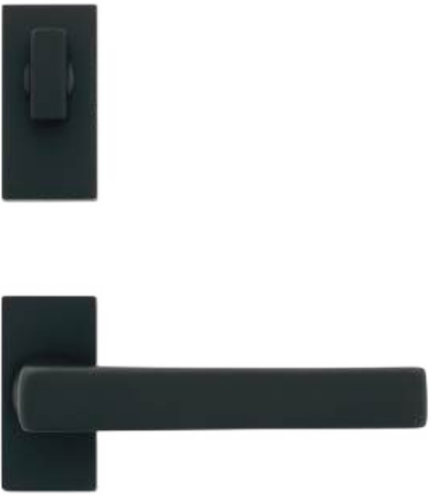
MINIMALIST HANDLE IN MATTE BLACK