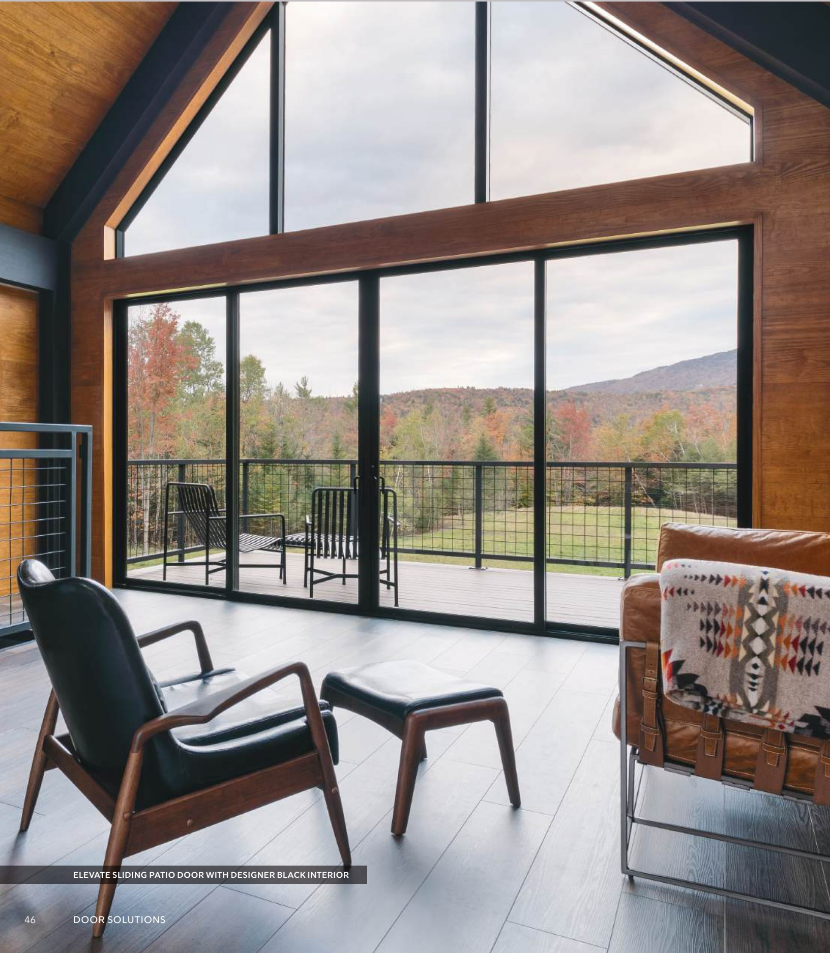
ELEVATE SLIDING PATIO DOOR WITH DESIGNER BLACK INTERIOR