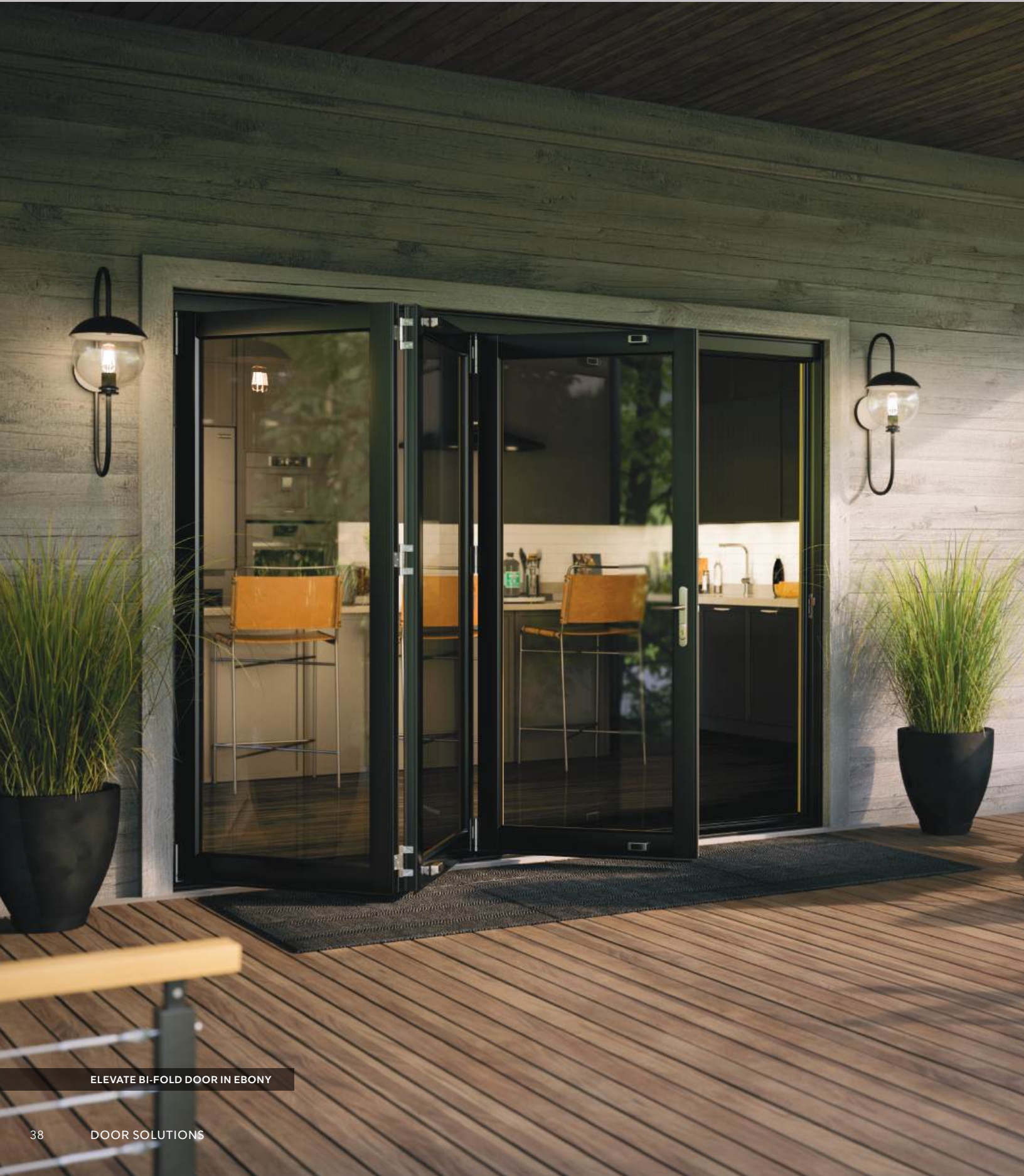
ELEVATE BI-FOLD DOOR IN EBONY