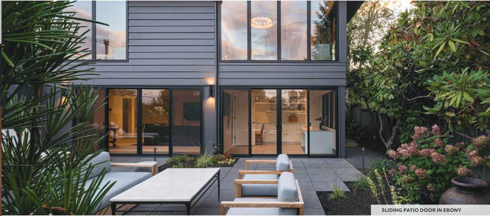
SLIDING PATIO DOOR IN EBONY

The Marvin Elevate Sliding Patio door offers contemporary lines and large expanses of glass, complemented by a rich wood interior and the durability of a Ultrex® fiberglass exterior for a sliding patio door that is as functional as it is beautiful. Select 2- or 3-panel configurations to achieve wide-open views up to 9 feet wide and a direct connection to outdoor living, all in a space-saving design when square footage is at a premium.