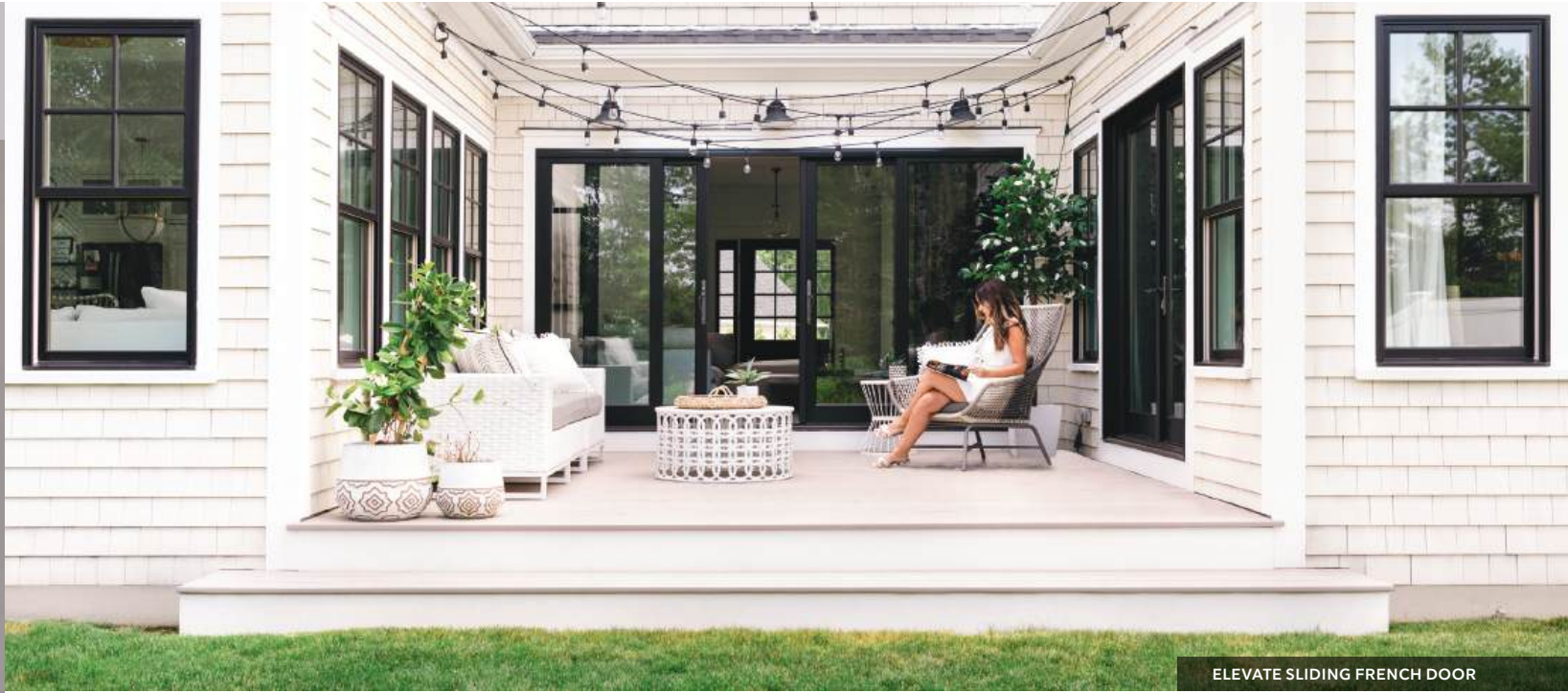
ELEVATE SLIDING FRENCH DOOR