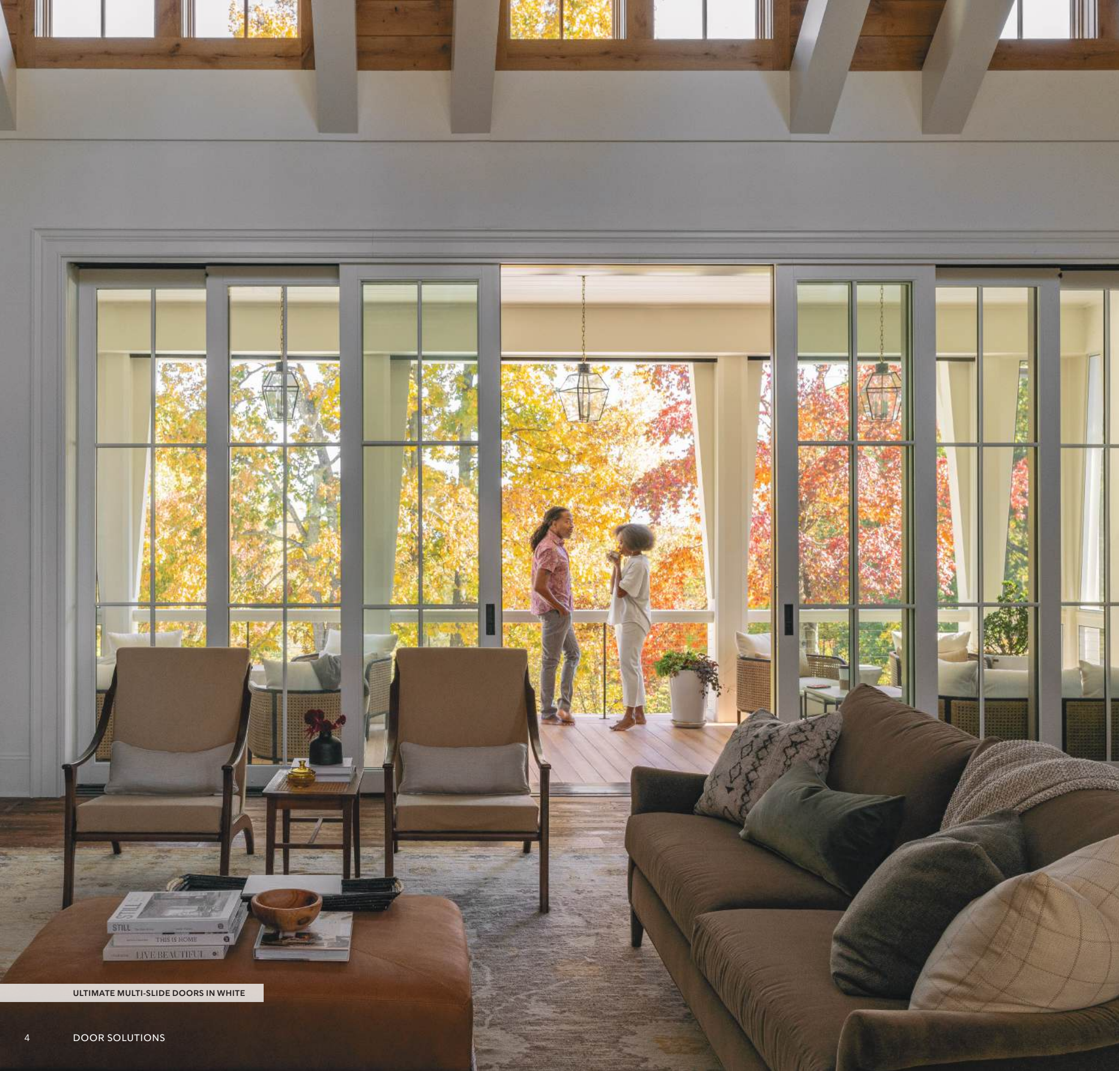
ULTIMATE MULTI-SLIDE DOORS IN WHITE