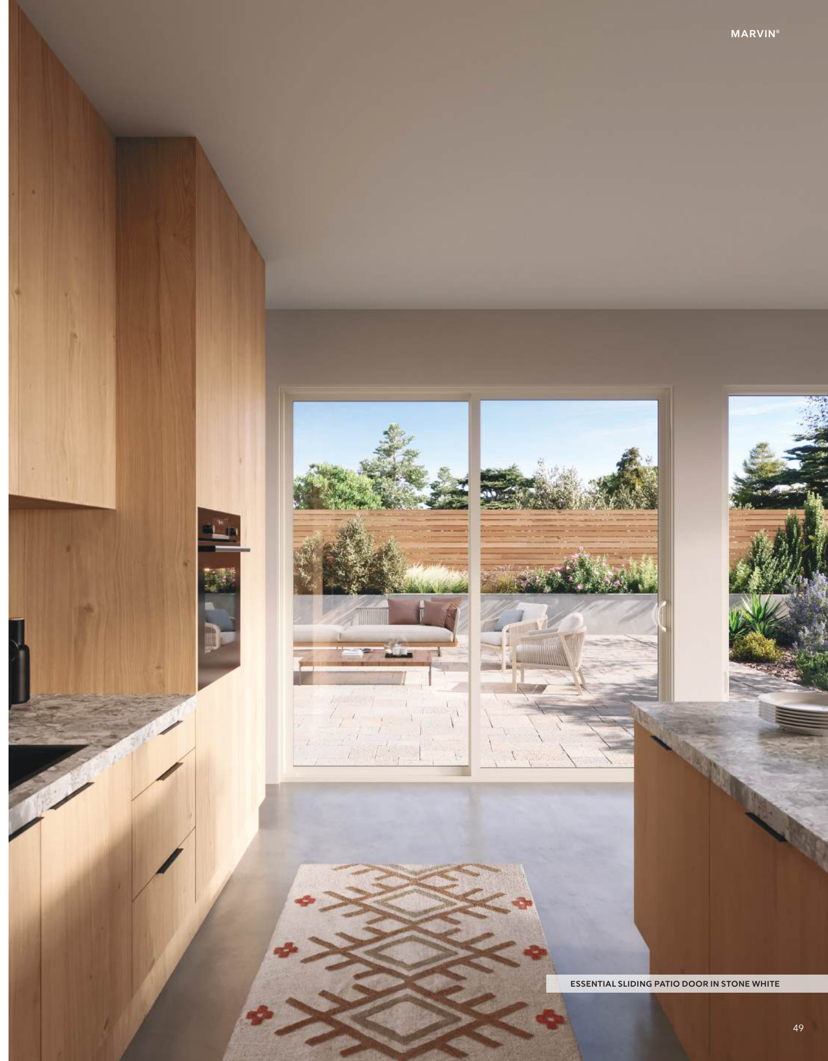
ESSENTIAL SLIDING PATIO DOOR IN STONE WHITE

Marvin Essential® products offer a simple approach to contemporary design and leading performance. A streamlined, easy-to-order product collection features durable, virtually maintenance-free Ultrex® fiberglass exteriors and interiors for a precise fit and finish.