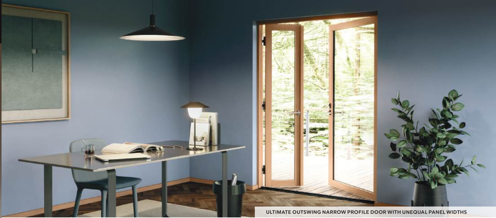
ULTIMATE OUTSWING NARROW PROFILE DOOR WITH UNEQUAL PANEL WIDTHS