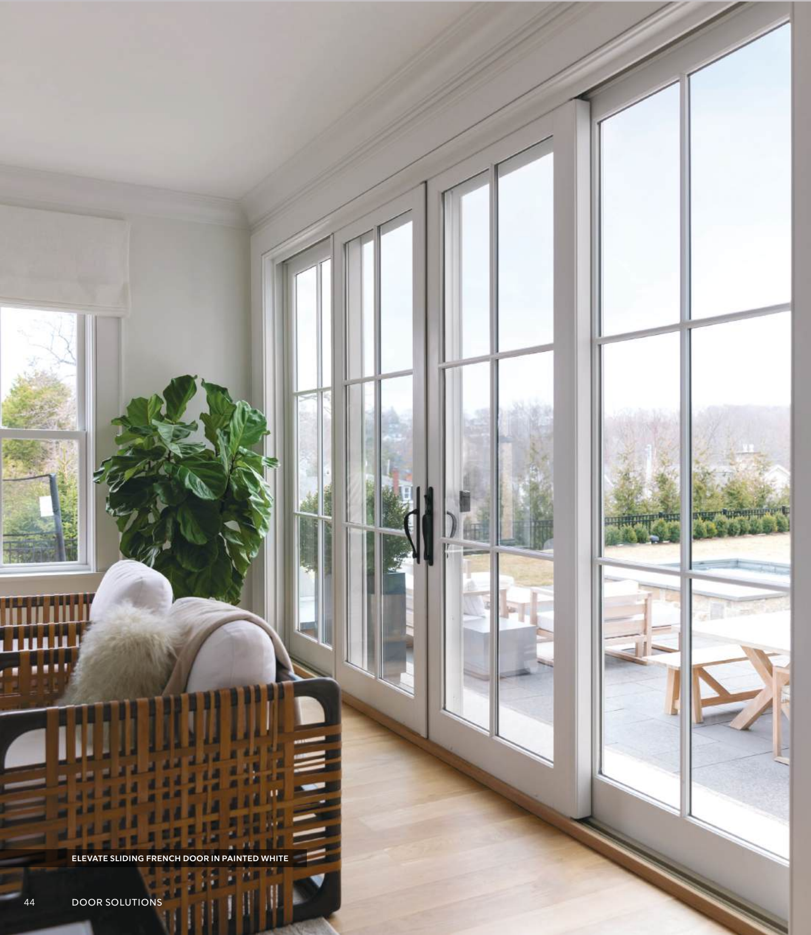
ELEVATE SLIDING FRENCH DOOR IN PAINTED WHITE