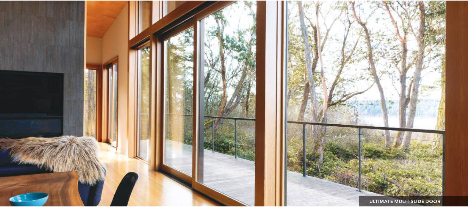
ULTIMATE MULTI-SLIDE DOOR