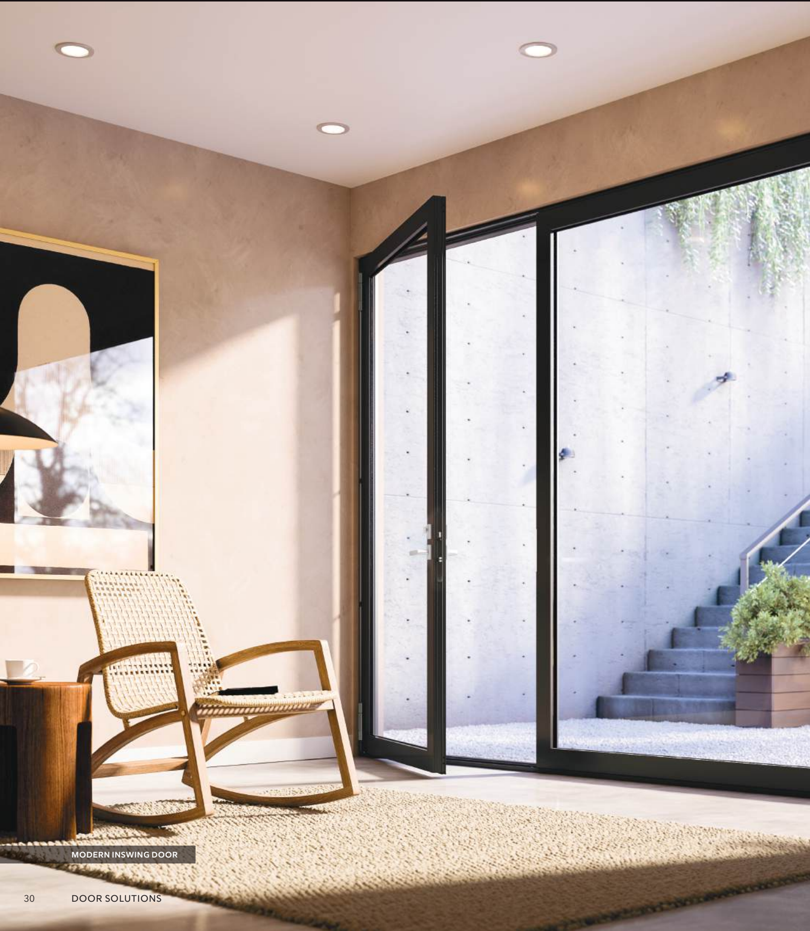
MODERN INSWING DOOR