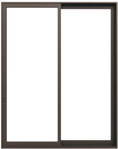
INTERIOR VIEW - SLIDING DOOR SHOWN IN BRONZE WITH MATTE BRONZE HARDWARE