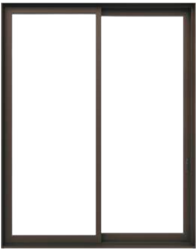
EXTERIOR VIEW - SLIDING DOOR SHOWN IN BRONZE WITH MATTE BRONZE HARDWARE

The Modern Sliding door showcases thoughtful innovation, authentic modern design, and precision engineering with the strength and thermal performance of High-Density Fiberglass. This popular door style is available in panel widths up to 5' and heights up to 12' to enable maximum views and light.