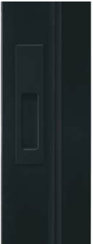
HARDWARE SHOWN IN MATTE BLACK