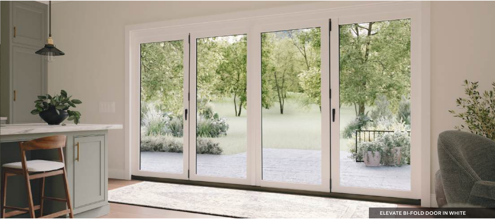
ELEVATE BI-FOLD DOOR IN WHITE