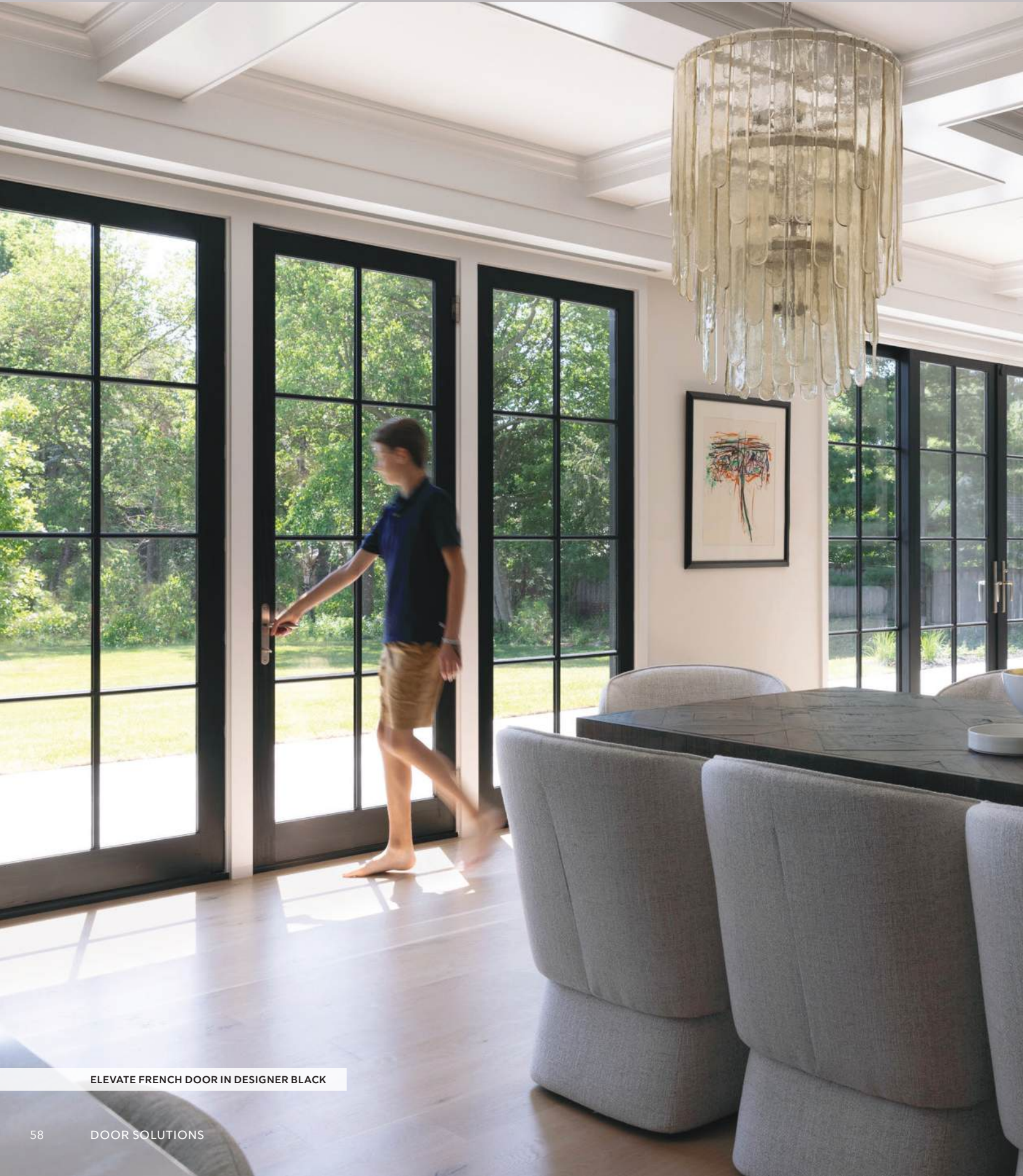
ELEVATE FRENCH DOOR IN DESIGNER BLACK