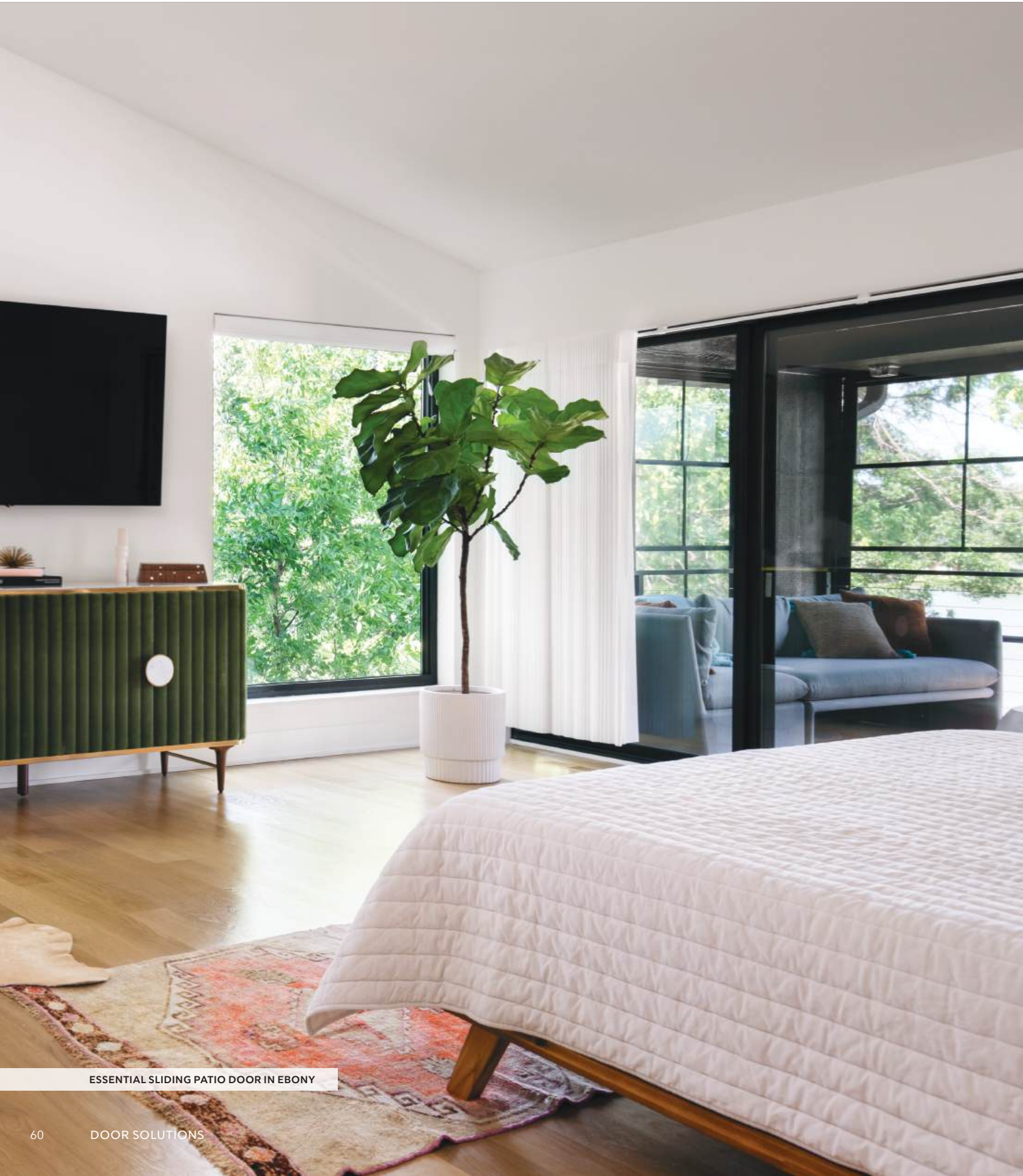
ESSENTIAL SLIDING PATIO DOOR IN EBONY