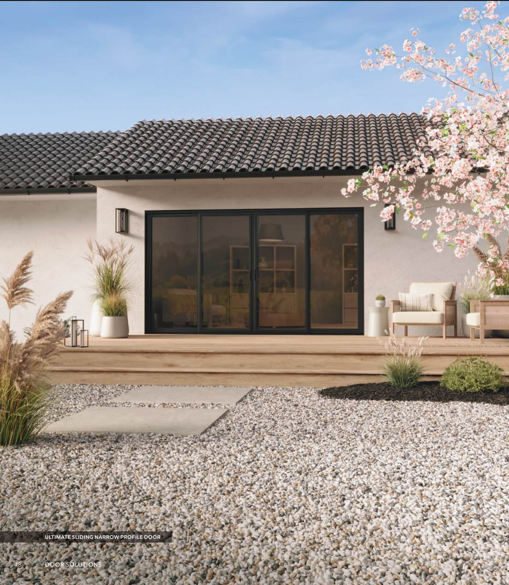
ULTIMATE SLIDING NARROW PROFILE DOOR