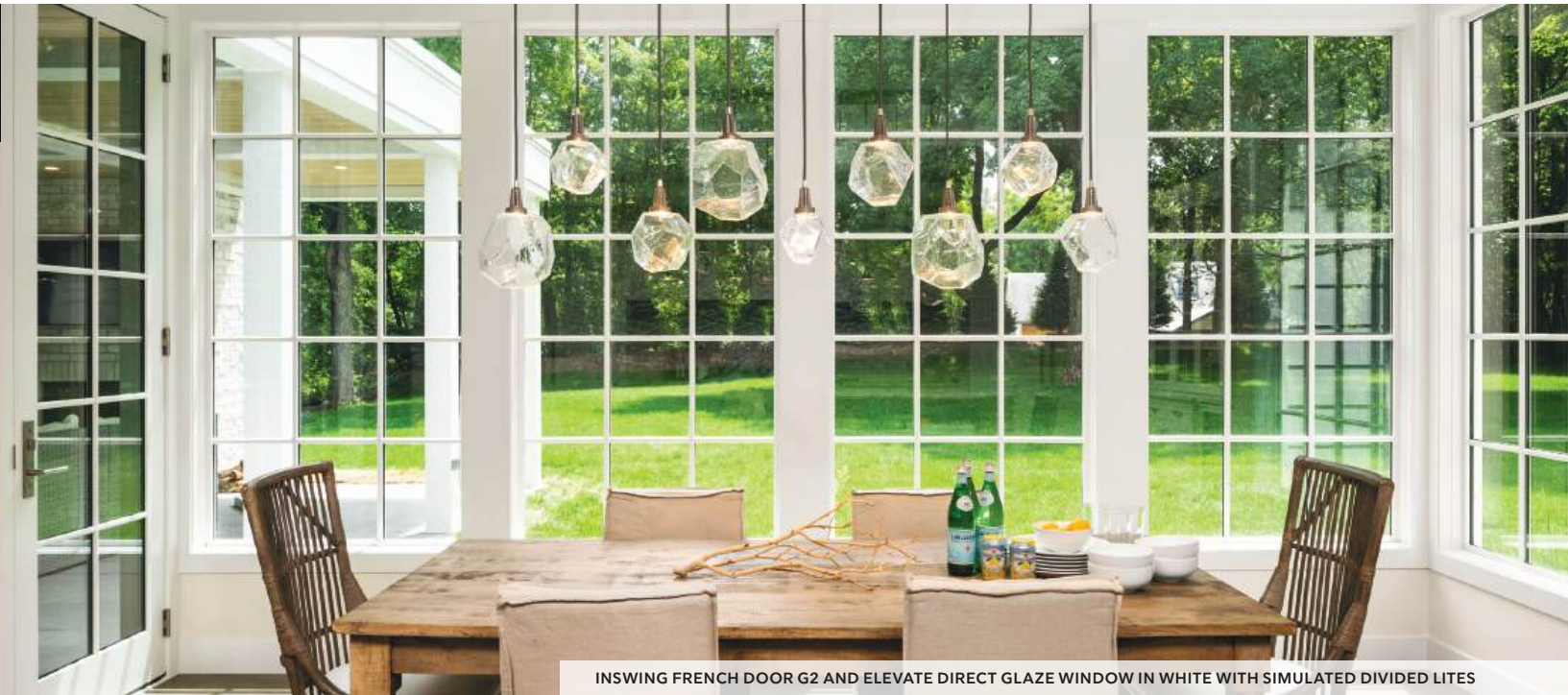
INSWING FRENCH DOOR G2 AND ELEVATE DIRECT GLAZE WINDOW IN WHITE WITH SIMULATED DIVIDED LITES