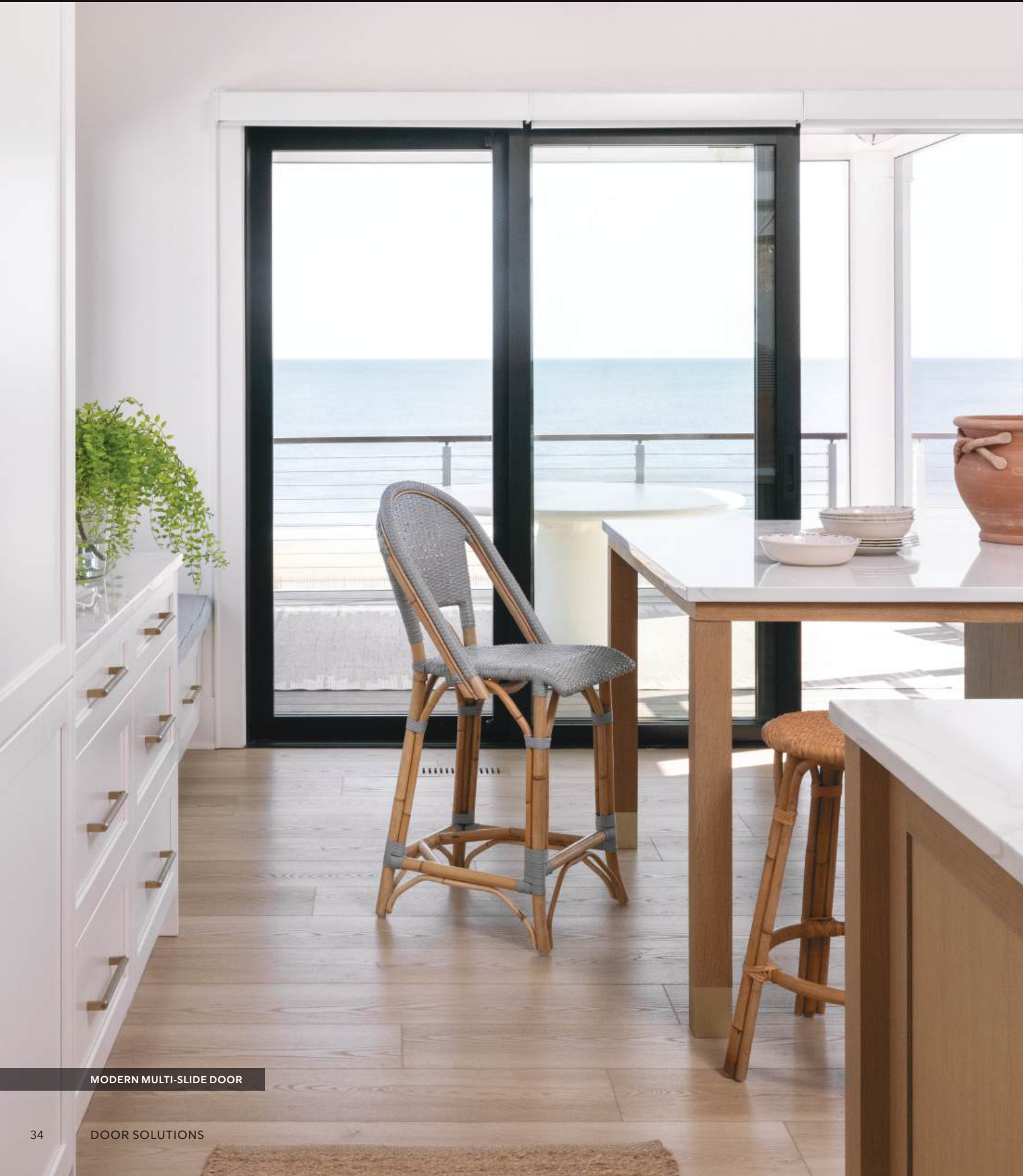
MODERN MULTI-SLIDE DOOR