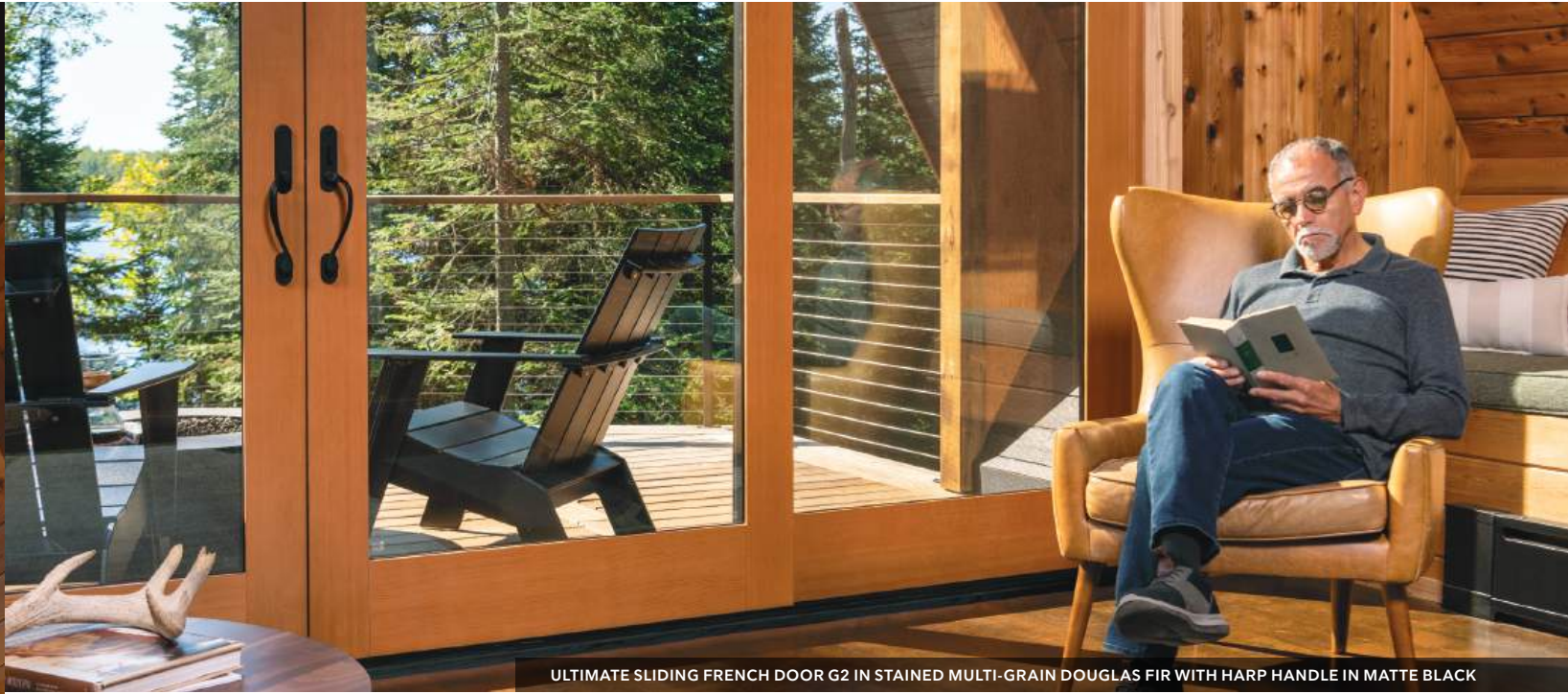
ULTIMATE SLIDING FRENCH DOOR G2 IN STAINED MULTI-GRAIN DOUGLAS FIR WITH HARP HANDLE IN MATTE BLACK