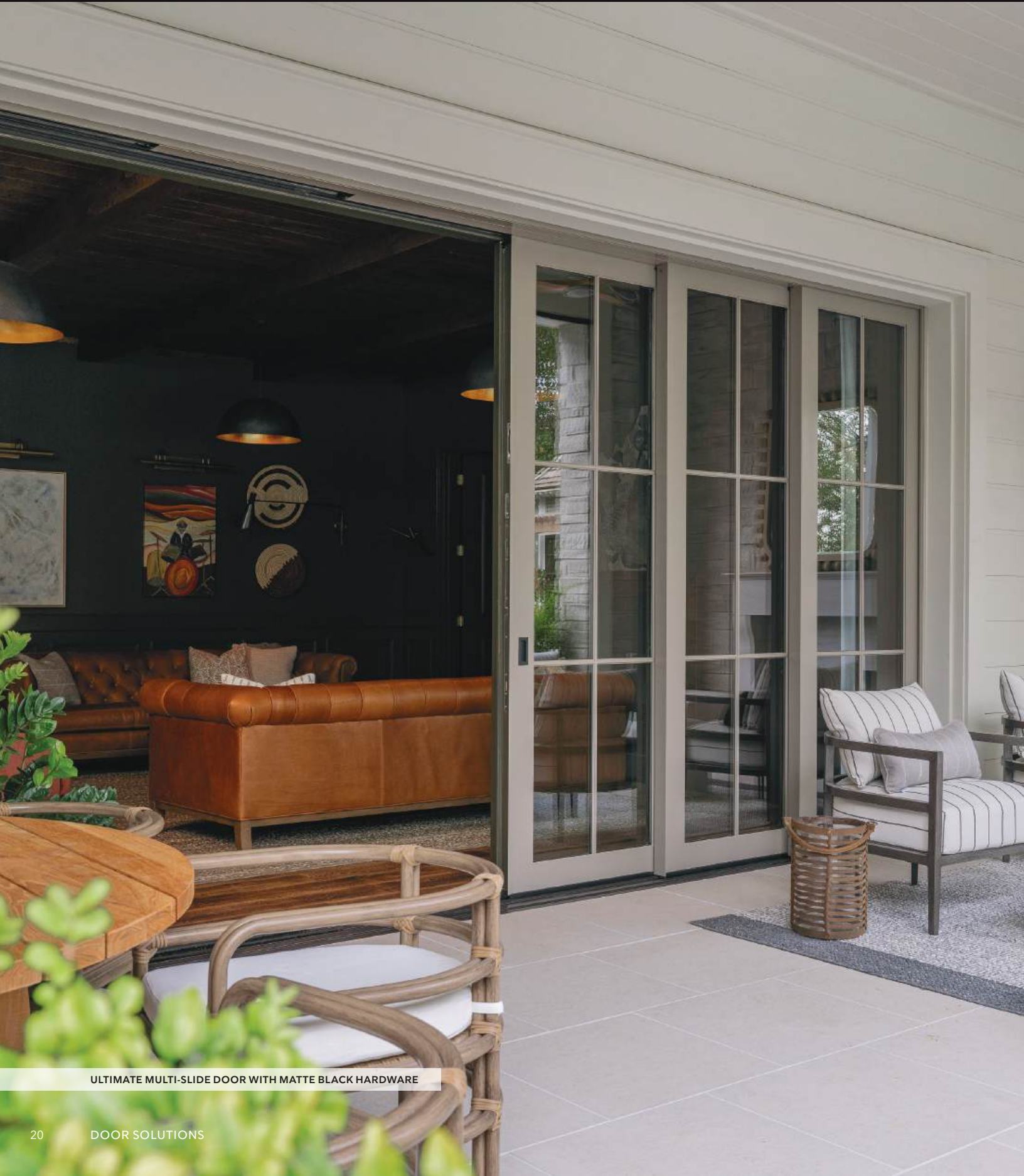
ULTIMATE MULTI-SLIDE DOOR WITH MATTE BLACK HARDWARE