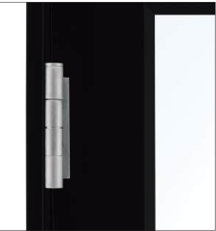
DOOR HINGE SHOWN IN SATIN NICKEL