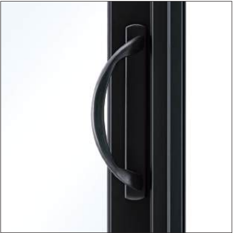
CAMBRIDGE HANDLE SHOWN IN MATTE BLACK