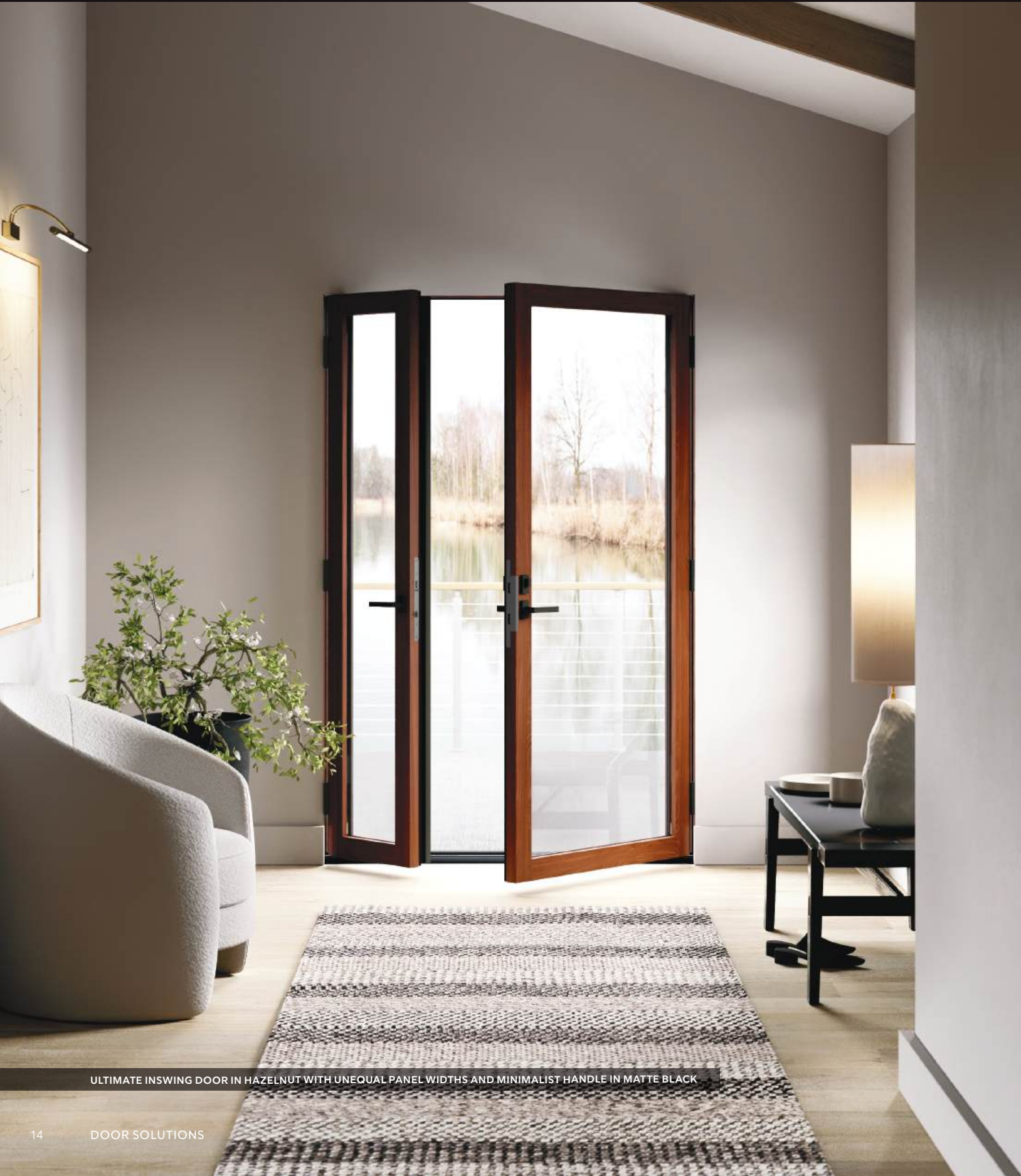
ULTIMATE INSWING DOOR IN HAZELNUT WITH UNEQUAL PANEL WIDTHS AND MINIMALIST HANDLE IN MATTE BLACK