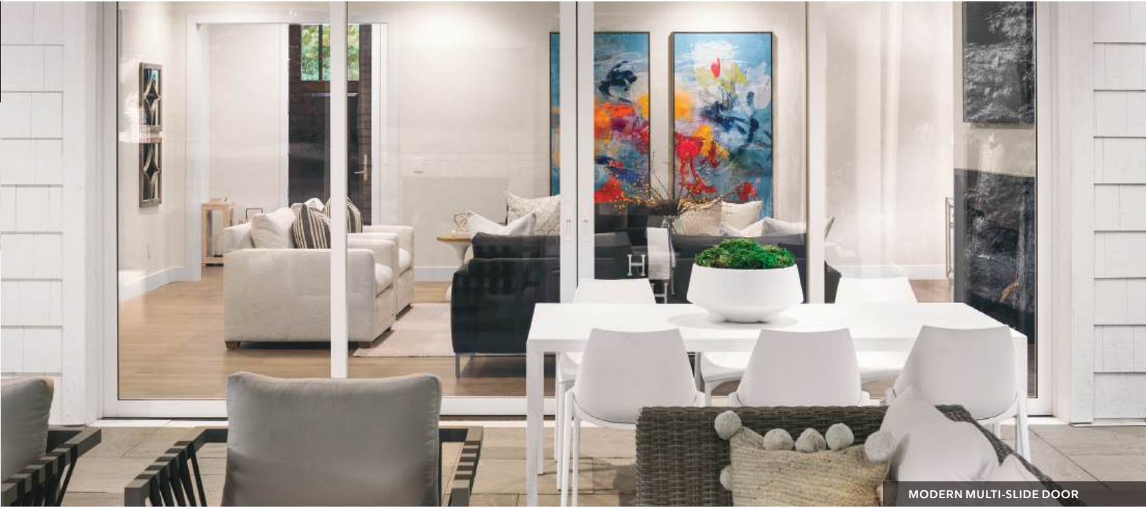
MODERN MULTI-SLIDE DOOR