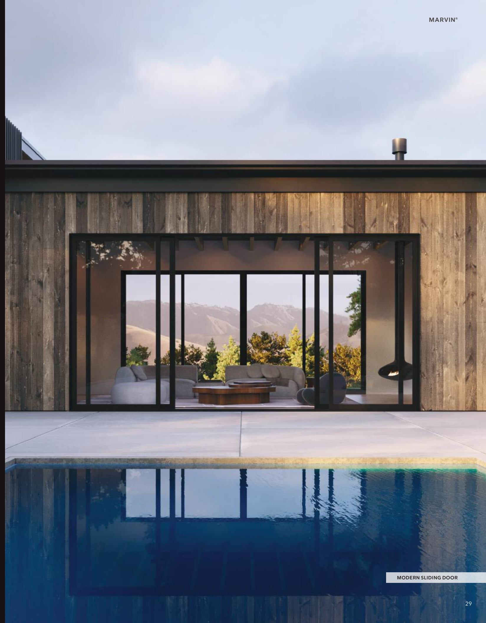
MODERN SLIDING DOOR

Marvin Modern brings exceptional design and performance together, creating a collection that meets the exacting principles and standards of true modern architecture. Innovative Marvin High-Density Fiberglass exteriors, leading thermal performance, consistent narrow sightlines, and a modular system all add up to the Modern collection – a seamless approach to modern design.