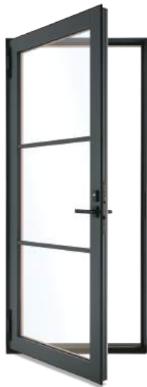
EXTERIOR VIEW OF OUTSWING

The Modern Swinging door pairs pure modern aesthetic with best-in-class performance for design flexibility to create with confidence. Available as both inswing and outswing, our Modern Swinging door is engineered with the same innovative modular system that allows Modern products to be mulled together, making it possible to create large, floor-to-ceiling configurations without sacrificing thermal performance even in the most demanding climates.