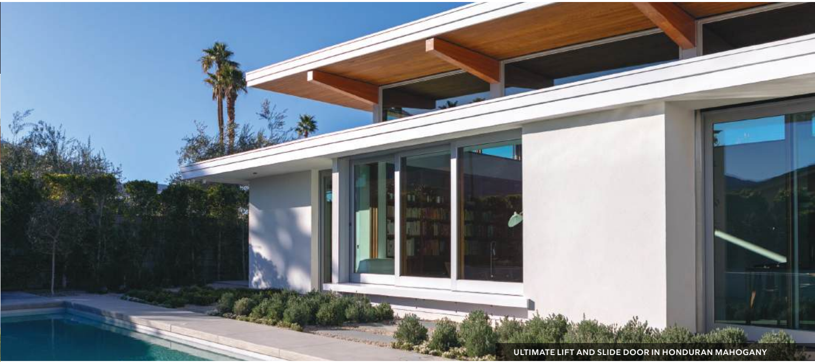
ULTIMATE LIFT AND SLIDE DOOR IN HONDURAN MAHOGANY