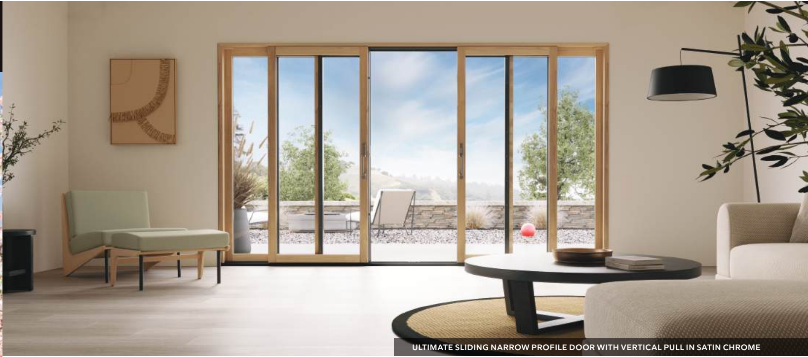
ULTIMATE SLIDING NARROW PROFILE DOOR WITH VERTICAL PULL IN SATIN CHROME