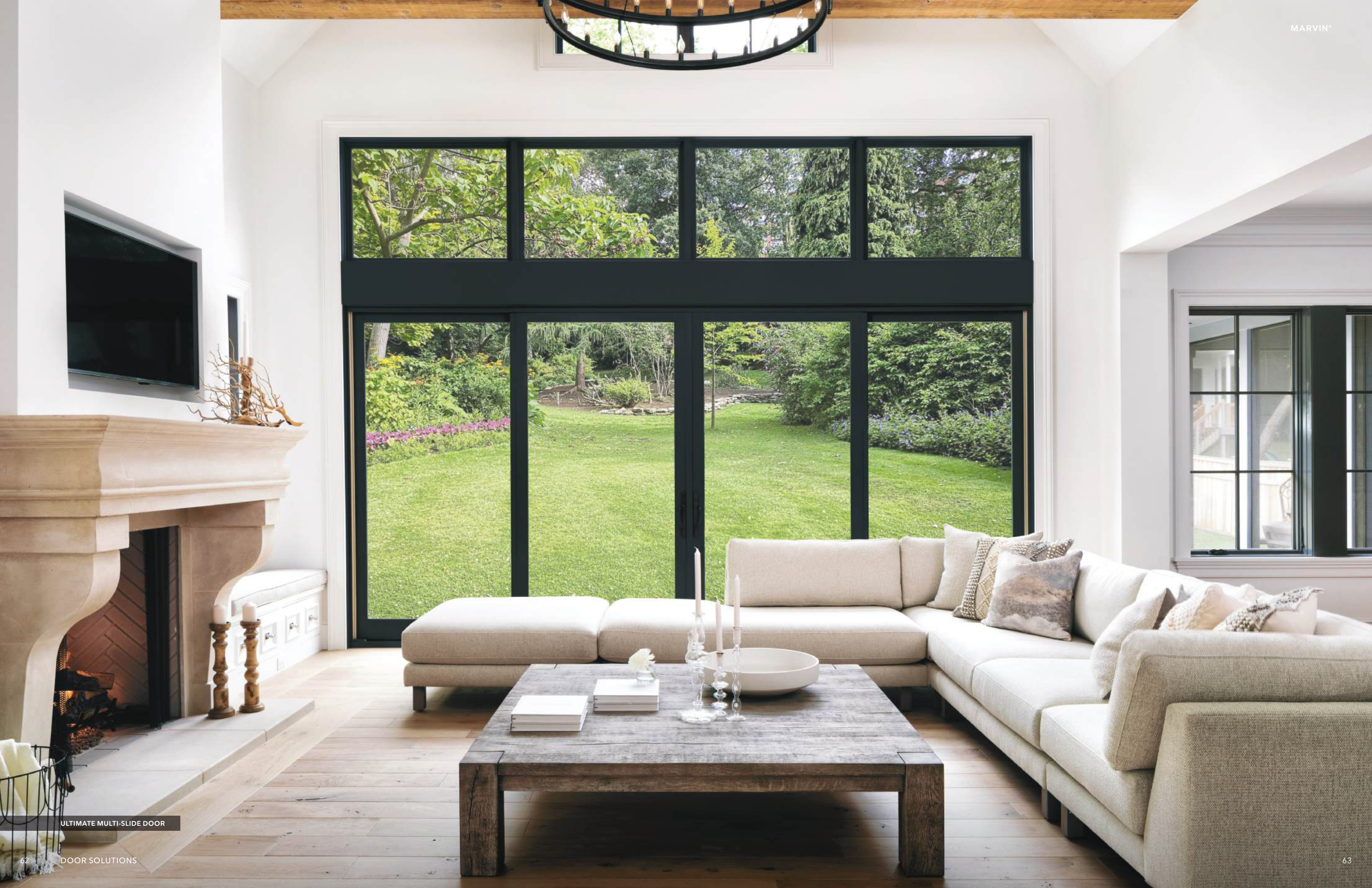
ULTIMATE MULTI-SLIDE DOOR