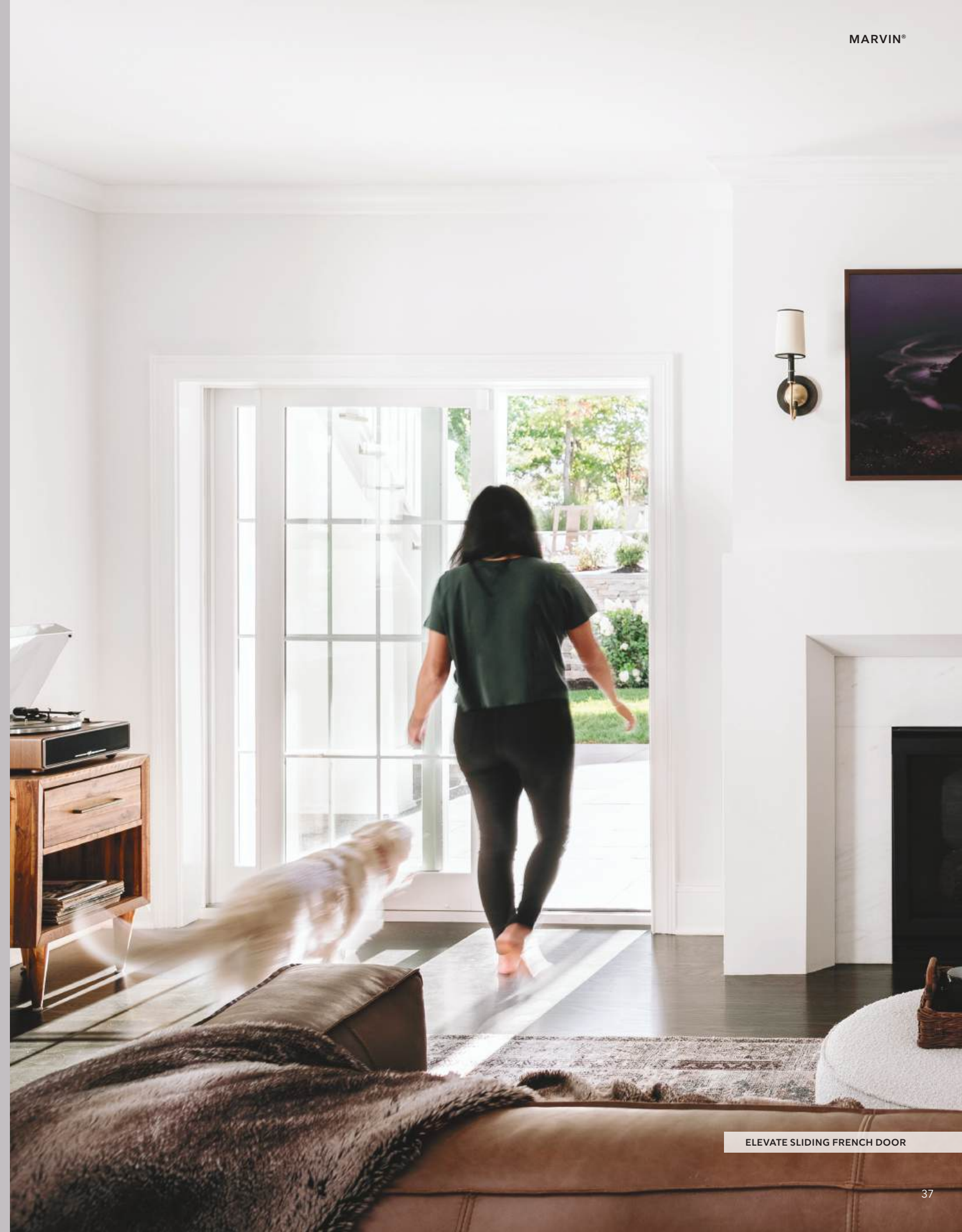
ELEVATE SLIDING FRENCH DOOR

Marvin Elevate® products provide the ideal blend of remarkable design and superior performance through a curated collection of the most popular products and options, warm wood interiors, and high-quality Ultrex® fiberglass exteriors that perform even in the harshest climates.