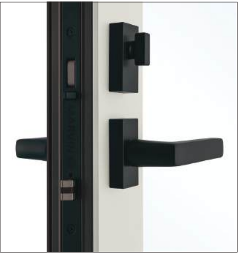
LEVER HANDLE IN MATTE BLACK