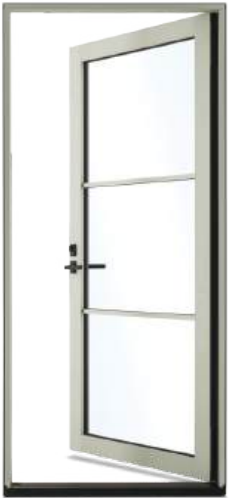
INTERIOR VIEW OF OUTSWING