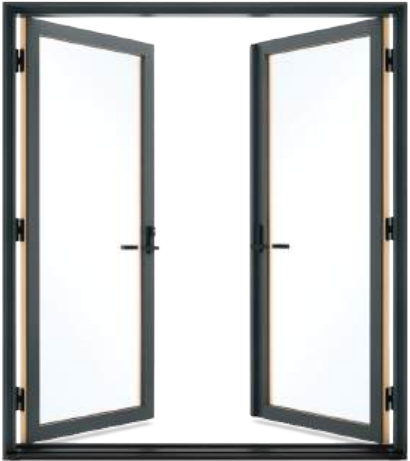
EXTERIOR VIEW OF INSWING