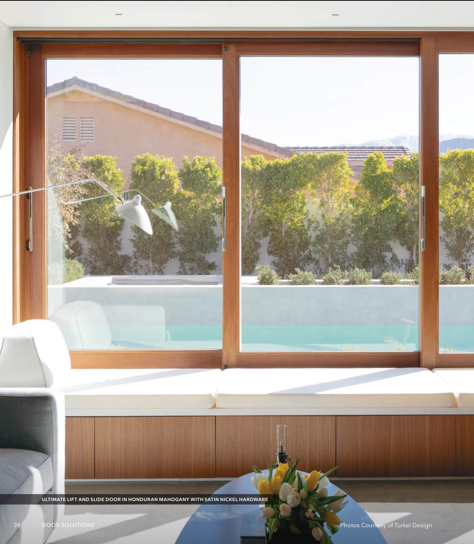
ULTIMATE LIFT AND SLIDE DOOR IN HONDURAN MAHOGANY WITH SATIN NICKEL HARDWARE