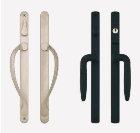
CAMBRIDGE HANDLES SHOWN IN SATIN NICKEL