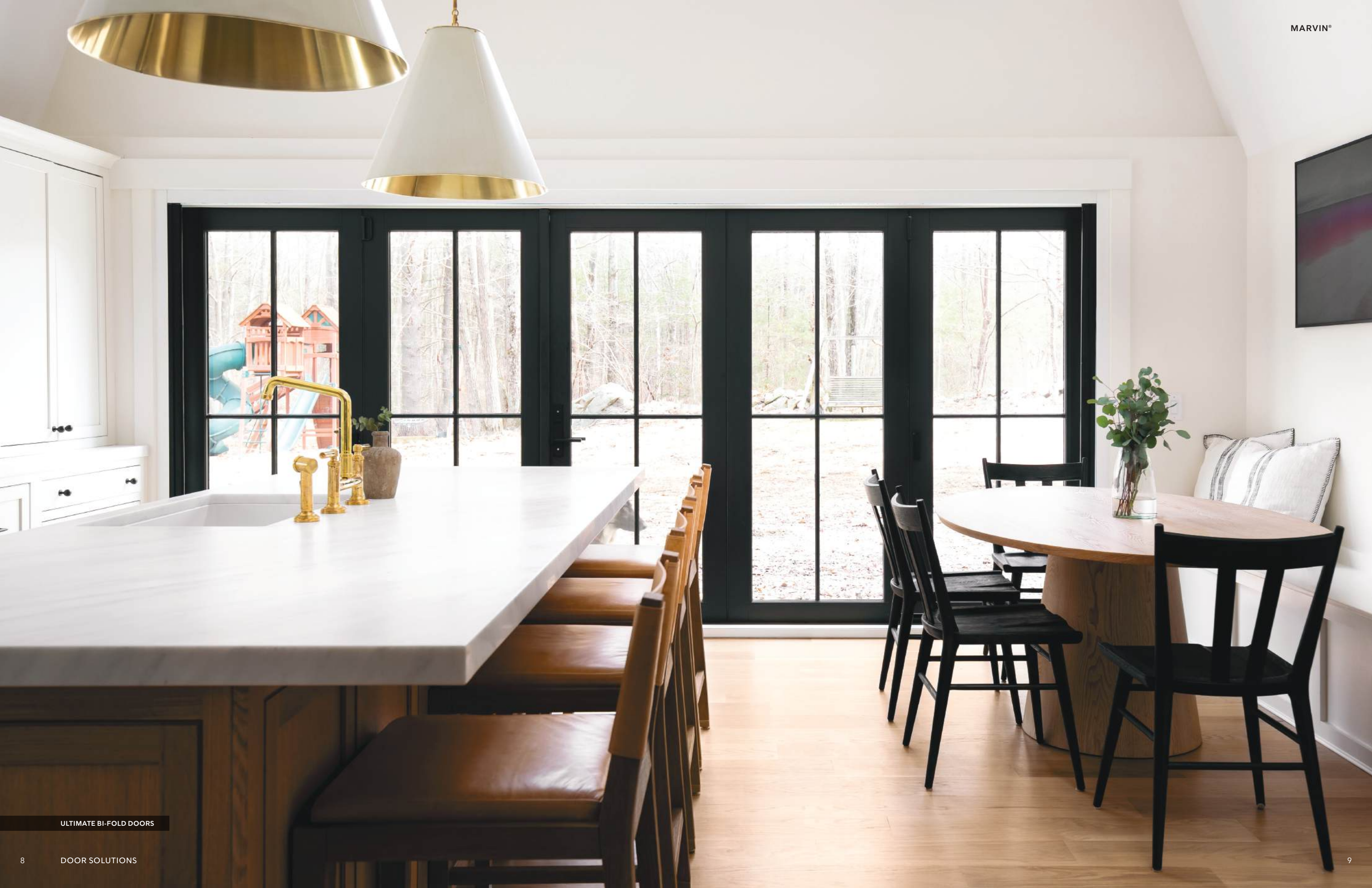
ULTIMATE BI-FOLD DOORS