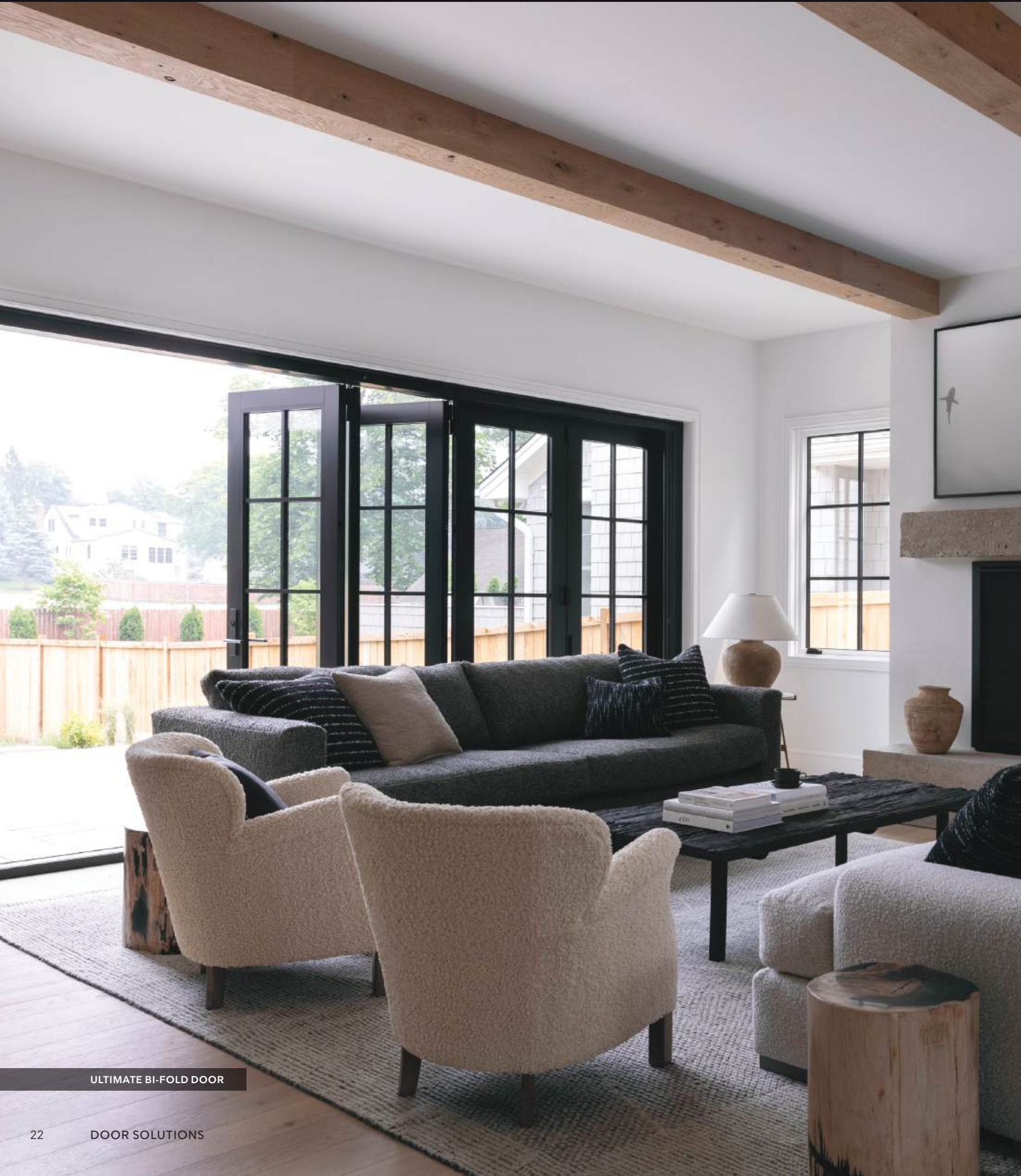
ULTIMATE BI-FOLD DOOR