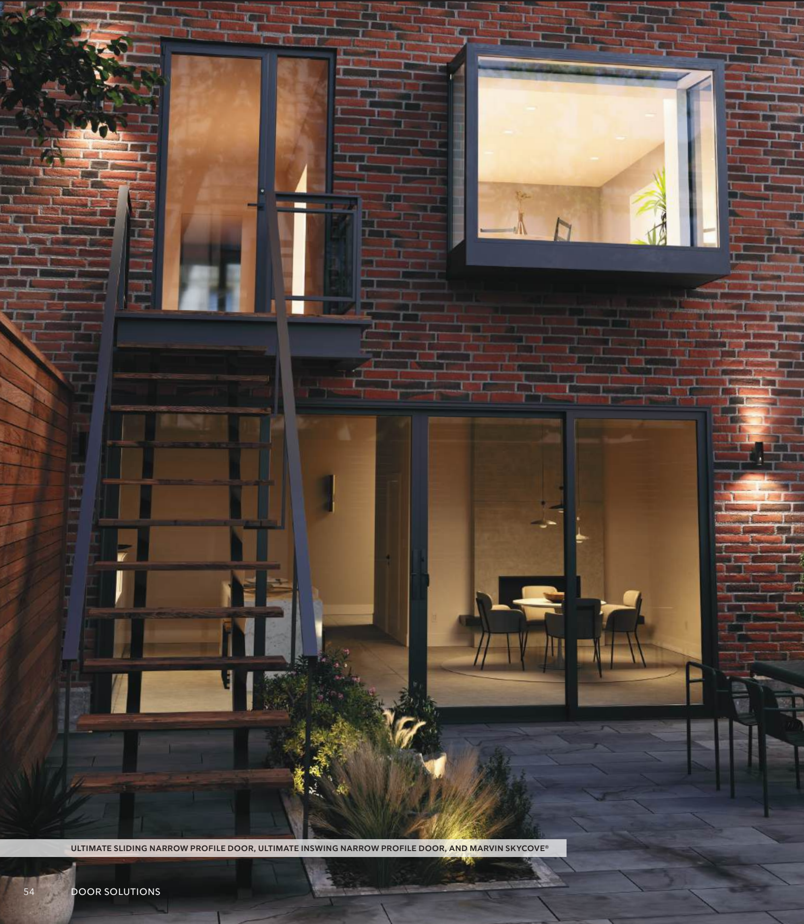
ULTIMATE SLIDING NARROW PROFILE DOOR, ULTIMATE INSWING NARROW PROFILE DOOR, AND MARVIN SKYCOVE®